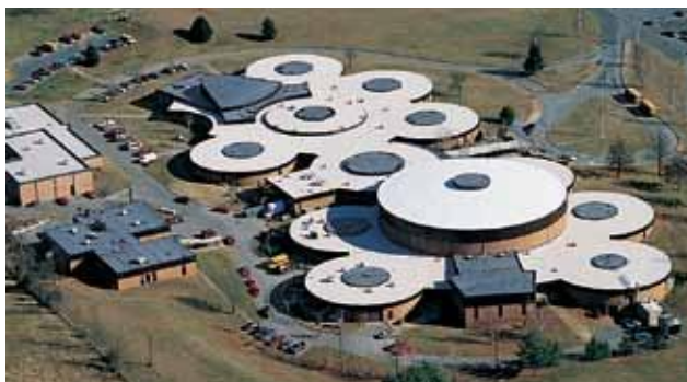
The development of complementary technologies has allowed EPDM to be beneficial in a wide number of applications, including plaza decks and larger projects using white EPDM membrane. Pictured (above) is a plaza deck paver system installed over a 145-mil EPDM system and (below) a white EPDM roof system.

In May of 2008, SPRI released a final report on a joint study with the Department of Energy (DOE) and the EPDM Roofing Association (ERA) entitled, "Evaluating the Energy Performance of Ballasted Roof Systems." The study shows that ballast and paver systems can save as much energy as a reflective or "cool" roof—even in southern climates.