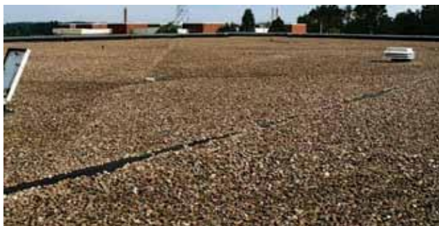
The 29-year-old EPDM roof protecting the Jamerich Building at Northern Michigan University in Marquette, Mich., is still performing well.